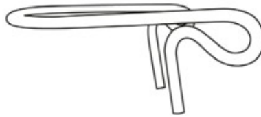
Preferred Direction of Pull